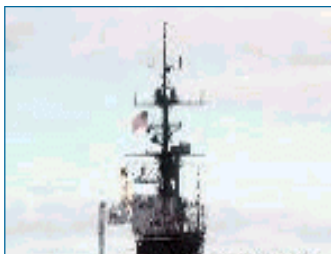
The USS Midway